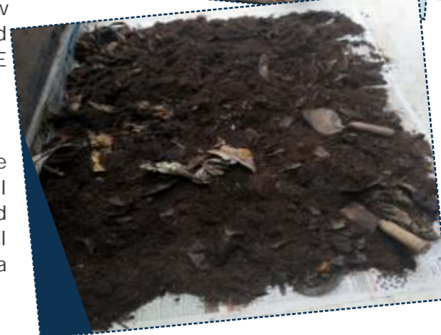
In the above pictures, it is the composted manure ready to be sieved. Below is the final product which I am now using in the plants and my kitchen garden.