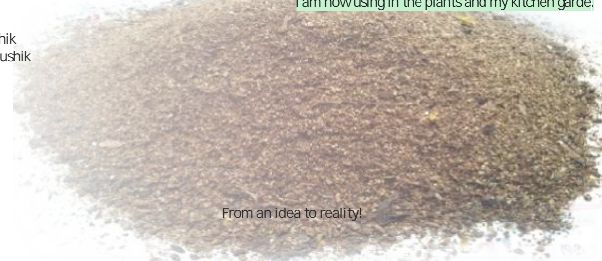
From an idea to reality!