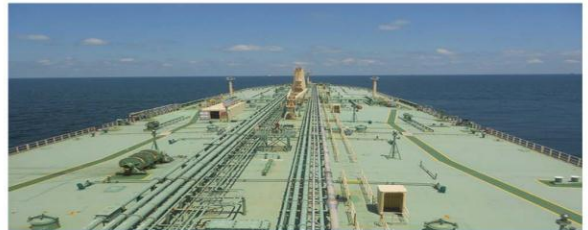
Name of ship : M.T. Sanko Blossom Type of ship : Crude Oil Tanker Year of build : 2005 Flag : Panama