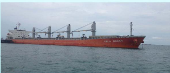
Name of ship : M.V. Vela Ocean Type of ship : Bulk Carrier Year of build : 2008 Flag : Singapore