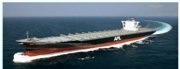
Name of ship : M.V. APL Antwerp Type of ship : Container Ship Year of build : 2013 Flag : Panama