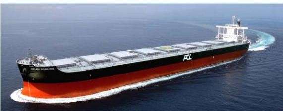
Name of ship : M.V. Jubilant Excelence Type of ship : Bulk Carrier Year of build : 2013 Flag : Panama