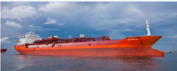
Name of ship : LPG/C Nusa Bintang Type of ship : LPG Tanker Year of build : 1992 Flag : Indonesia