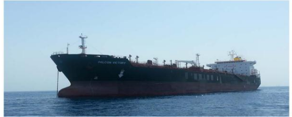
Name of ship : M.T. Falcon Victory Type of ship : Chemical/Oil Product Tanker Year of build : 1999 Flag : Singapore