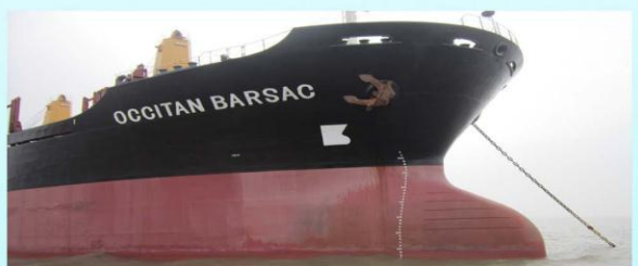
Name of ship : M.V. Occitan Barsac Type of ship : Bulk Carrier Year of build : 2003 Flag : Bahamas