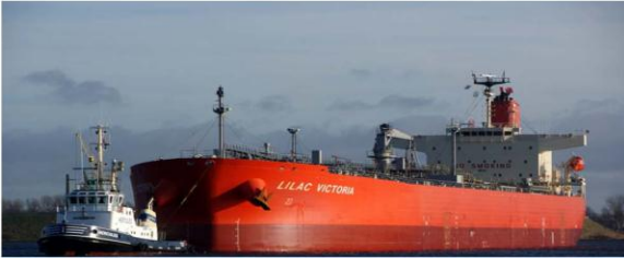
Name of ship : M.T. Lilac Victoria Type of ship : Oil Product Tanker Year of build : 2011 Flag : Marshall Islands